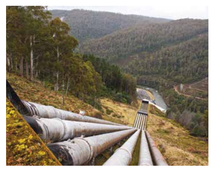
Tarraleah power station

A further challenge was that it had been impossible to fully integrate the Australian mainland into the studies because the PSS®E models of each system were implemented using incompatible PSS®E versions with many user-defined models, which caused conversion issues. As a result, small system equivalents were required. Hydro Tasmania realized it could do better.