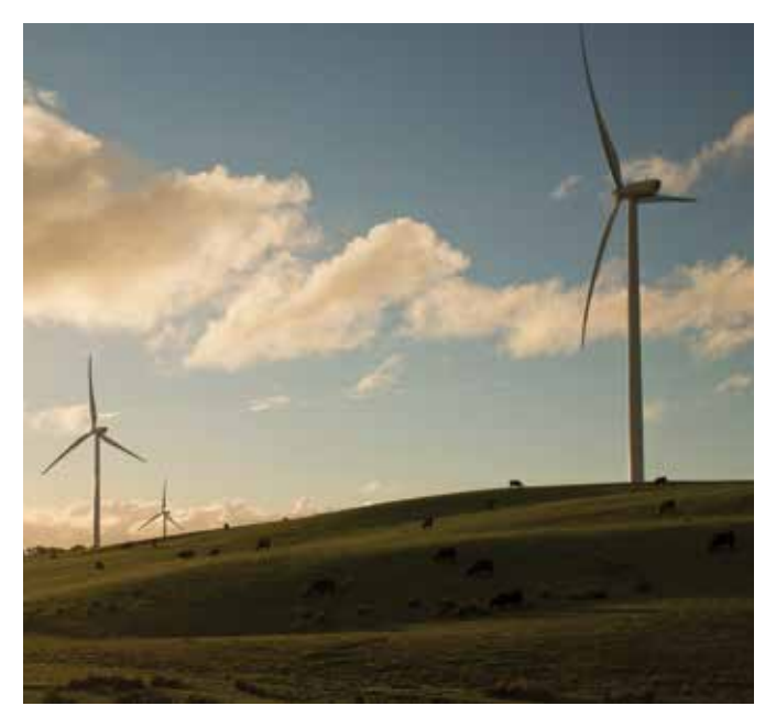
Musselroe wind farm

For example, Hydro Tasmania currently uses the hybrid interface to simulate the impact of Siemens PTI's frequency stabilizer modeled in-house, based on the PSCAD static synchronous compensator (STATCOM) model with a larger energy source, which interfaces with the PSS®E model of the AC system. This allows Hydro Tasmania to assess the frequency stabilizer capability to provide ancillary services, while also providing other services such as V-Q support, phase balancing, and more. Hydro Tasmania plans to augment the simulation model to include an HVDC model with the frequency controller.